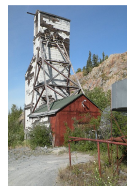
Giant Mine Small Head Frame, Summer 2009