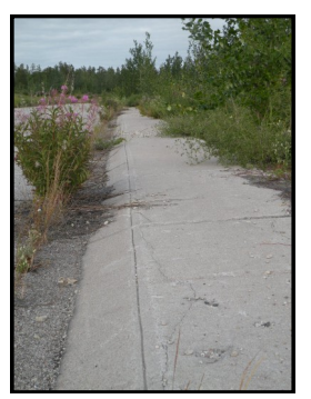
Pine Point Sidewalk, Summer 2009