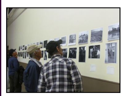
Rankin Inlet History Workshop, August 2011