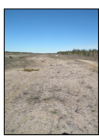
Pine Point (J. Sandlos 2010)

If you are interested in John and Arn's earlier article on northern mining in the journal Environmental Justice , it is an open access publication available <u>here</u>.