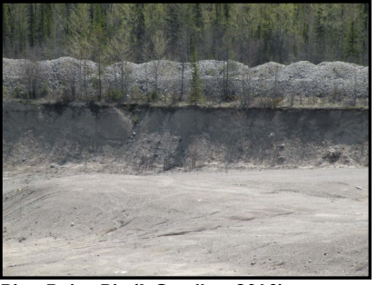
Pine Point Pit